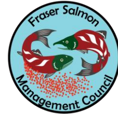
Fraser Salmon Management Council (2014)