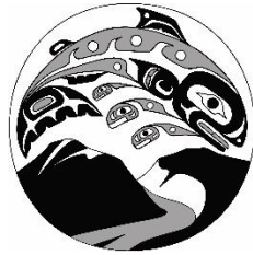
Fraser River Aboriginal Fisheries Secretariat (1994)