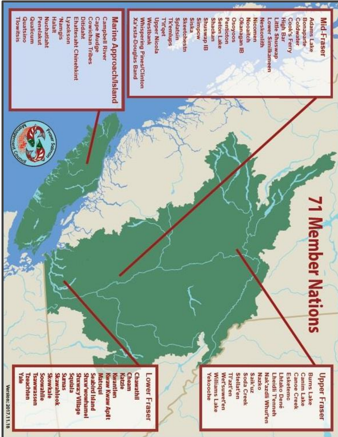
Map of the 71 FSMC Member Nations