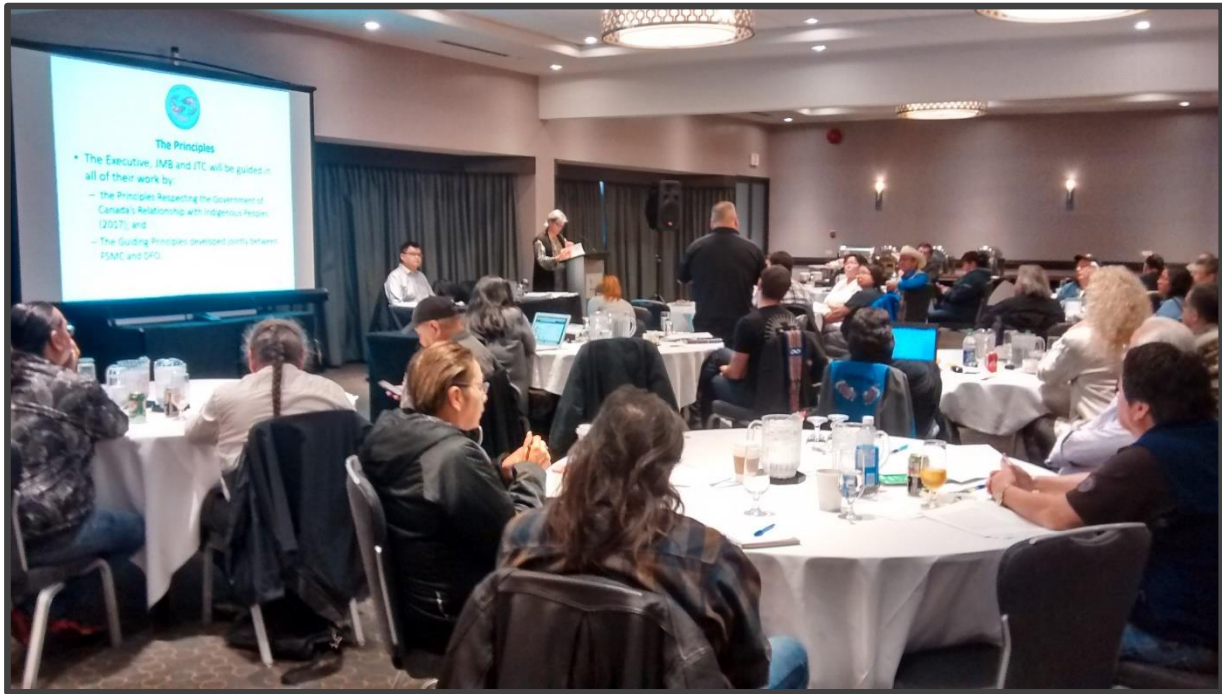
The United Nations Declaration on the Rights of Indigenous Peoples (UNDRIP) being discussed at the Assembly. UNDRIP is included in the Draft Agreement in the Principles section agreed to by both Parties.