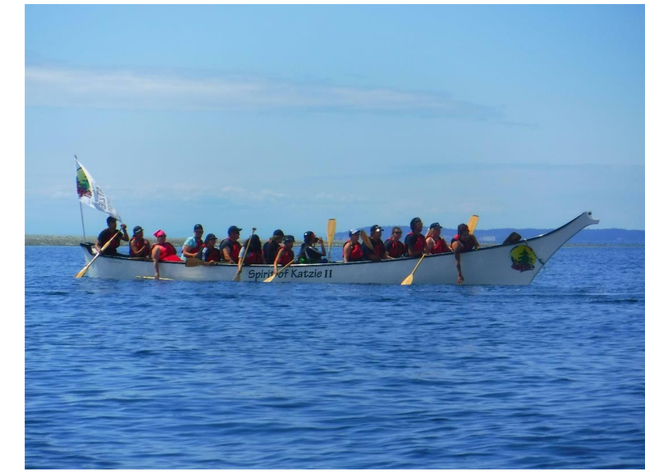
Katzie First Nation in Tla'amin Nation